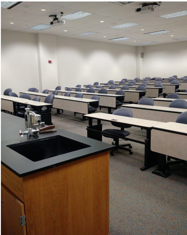
Levey Hall- This is Levey 100 which is one of the rooms where you can take the ACT. This room is used for science classes and is the biggest classroom on the campus.