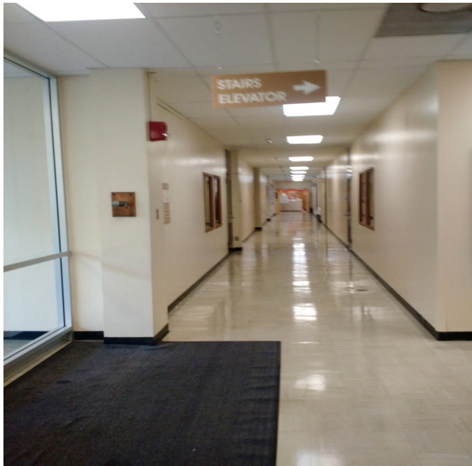
Inside Johnston Hall- This is part of the building where classes take place; straight ahead is where you can sign up for tutors and get financial, athletic, and academic help. Johnston Hall is also the main building on the campus.