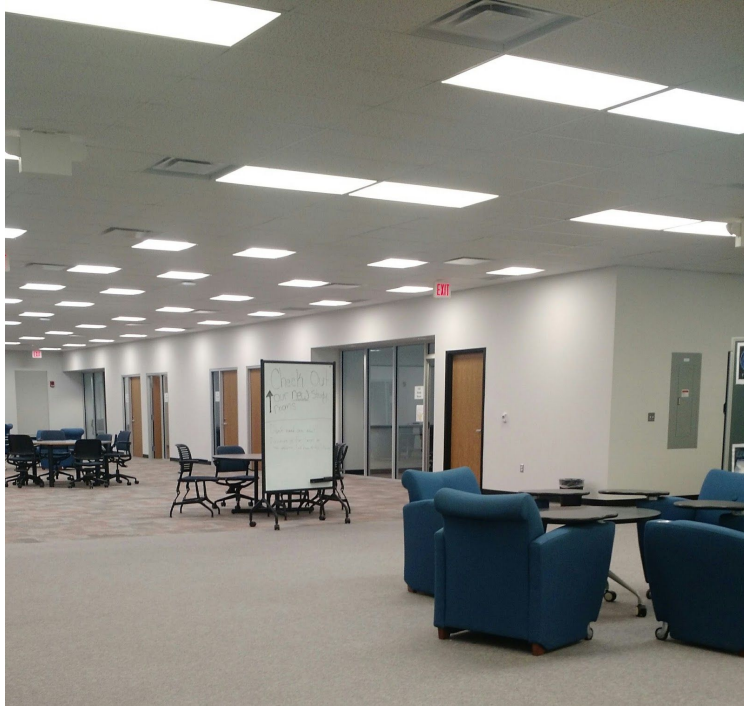
Study Hall- It is also new and you can ask anyone who works there to help you. It is very big and has a lot of open space.