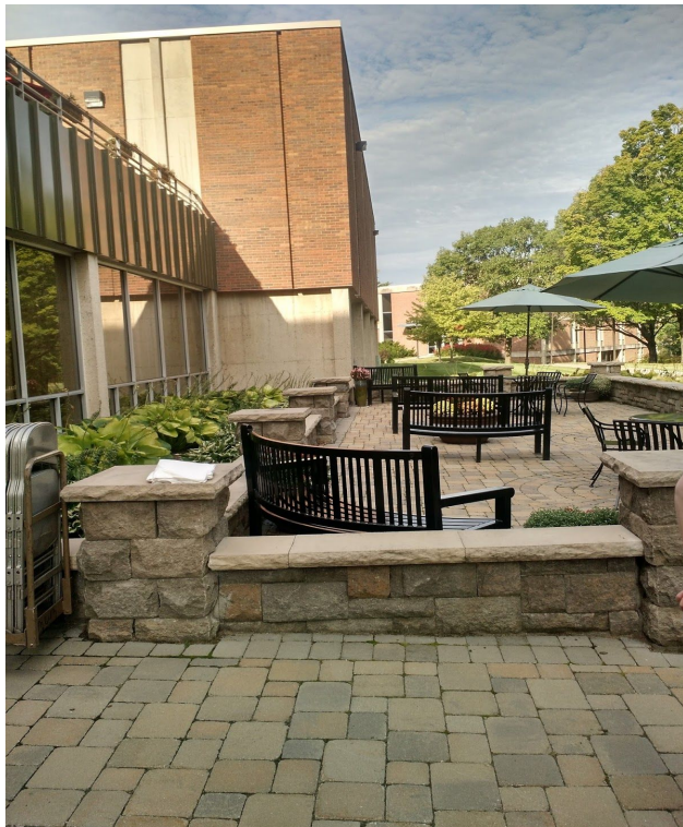
Outside Johnston Hall- This is one of MUM's hang-out/study areas. There is also a balcony to use as a quiet study area.