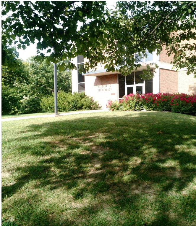
Science and Technology Building- It's a long walk to get to this building. But it is one of the buildings you go to if you are going into the nursing/medical field.