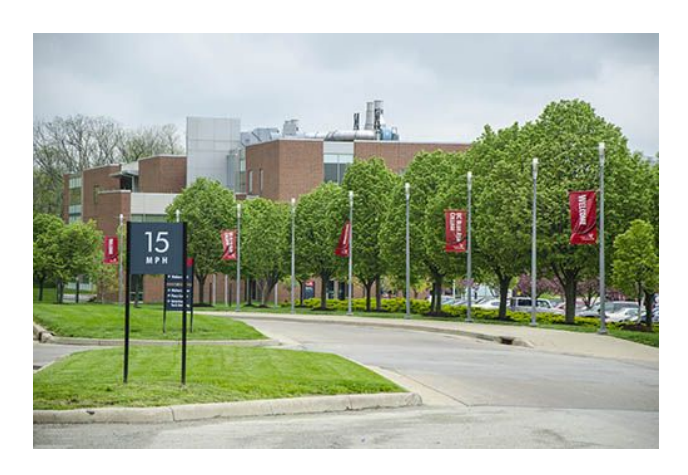
Parking lot at Uc Blue Ash.