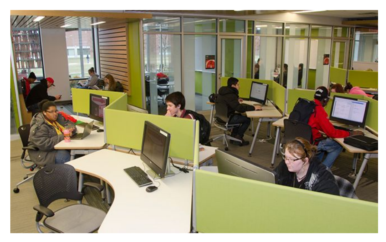
Library and Study Room.