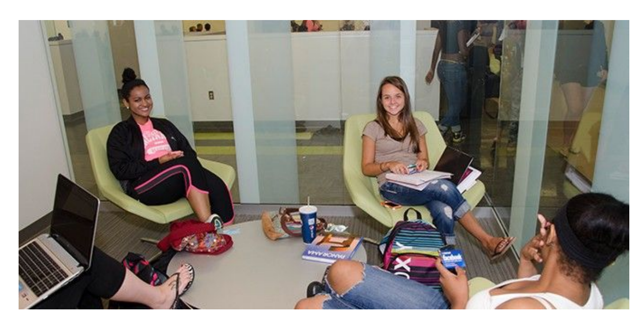
Private Study Room in the library.