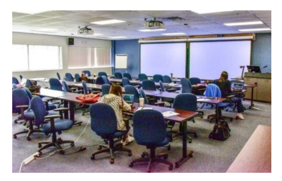
A classroom in at Blue Ash.

Muntz Hall was created in 1967 and held classrooms and offices. It was re-created and became the the largest building on campus. It includes classrooms and 3 study rooms and much more.