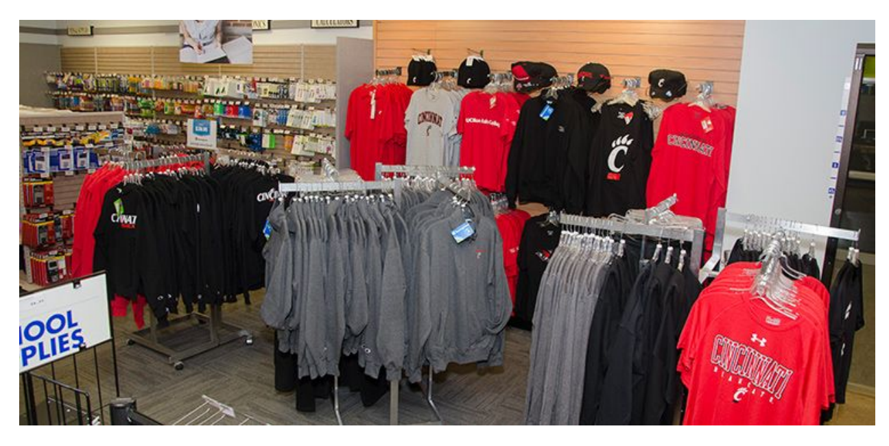
Book store and Spirit Wear.