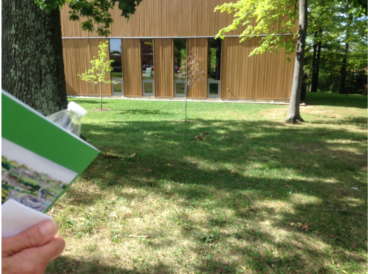
This is a side view of the chapel that is on campus for anyone who may like to go and visit. It is a universal chapel, for any religion that you may study.