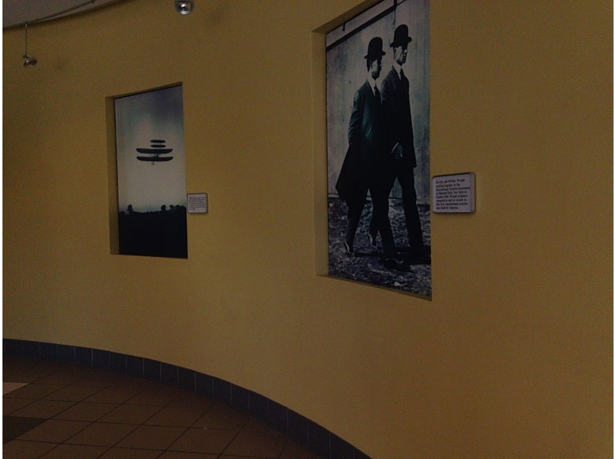
On the inside of a lot of the buildings are pictures of the Wright brothers, the reason for the naming of the university. There are certain areas of this hall way that have really interesting information on them.