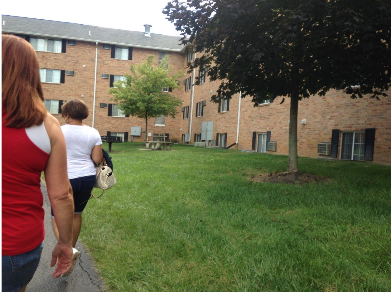
This is the side of one of the resident halls, The Woods, which is where most of the first year students end up staying. This building includes rooms for up to six students per room.