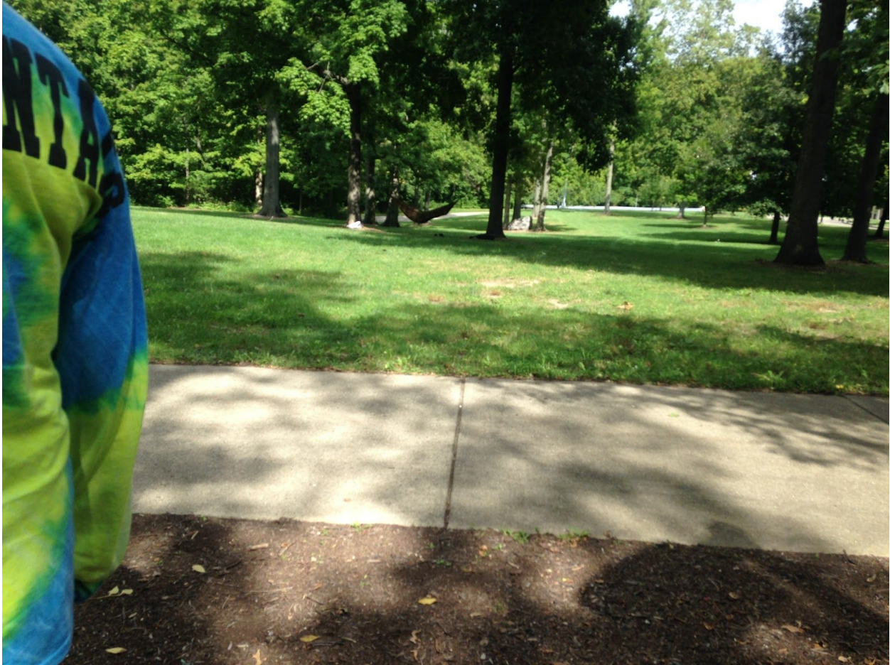
On my way to the woods, we passed a student lying in a hammock and studying.