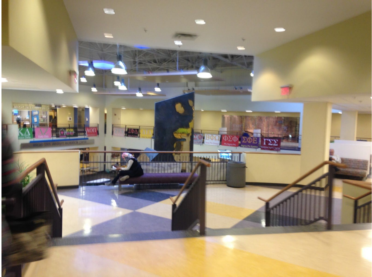
This is the upstairs view of the middle of the Student union building where you can see all of the different sororities and fraternities Wright State has.