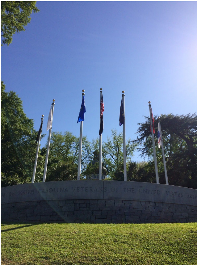
This is one of the few veteran memorial shrines in Columbia.