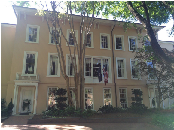
This building is the president of the university's house. It's in the horseshoe located right across from the student housing.