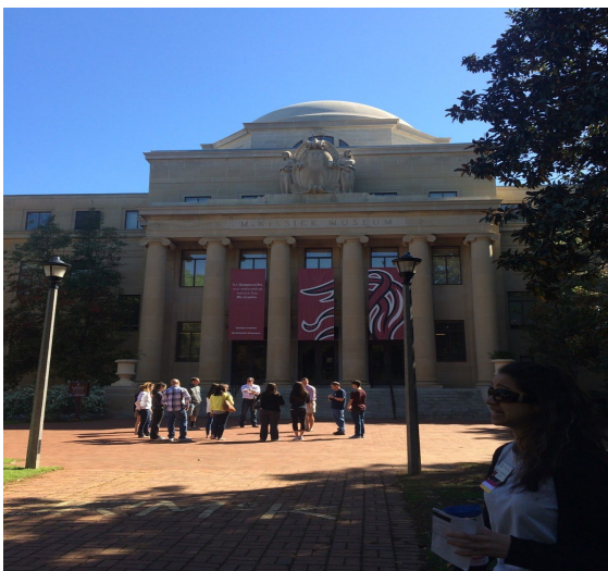
This is the library. It has seven floors: four underground and three up top. It's used for tutoring, studying, and doing homework.