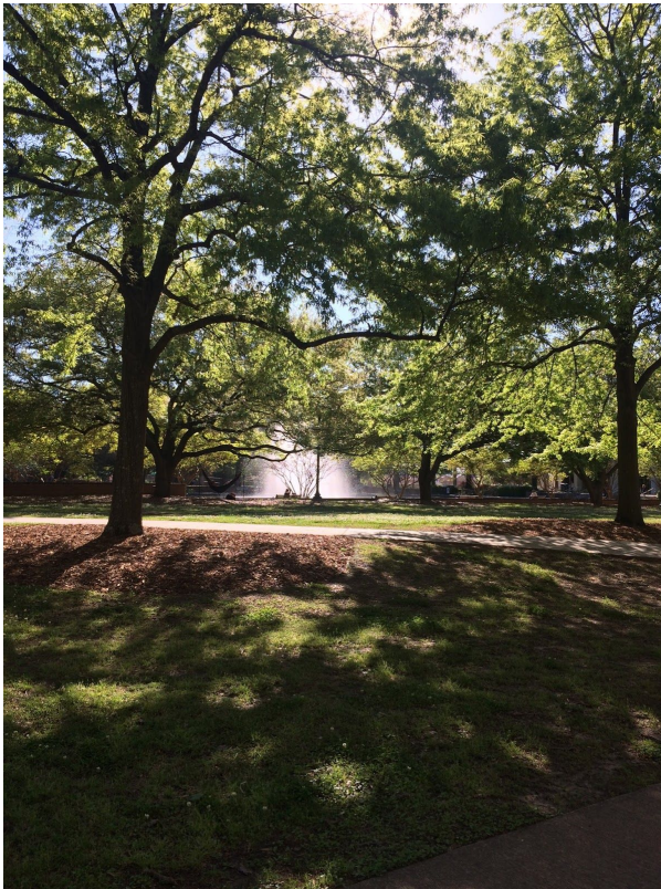
This is the area that's called the horseshoe. It is located by the student dorms and is the place where people just go to hang out and relax.