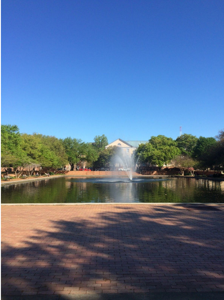
This is the fountain and pond that's in front of the library on campus.