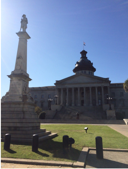
This is Columbia's historical building.