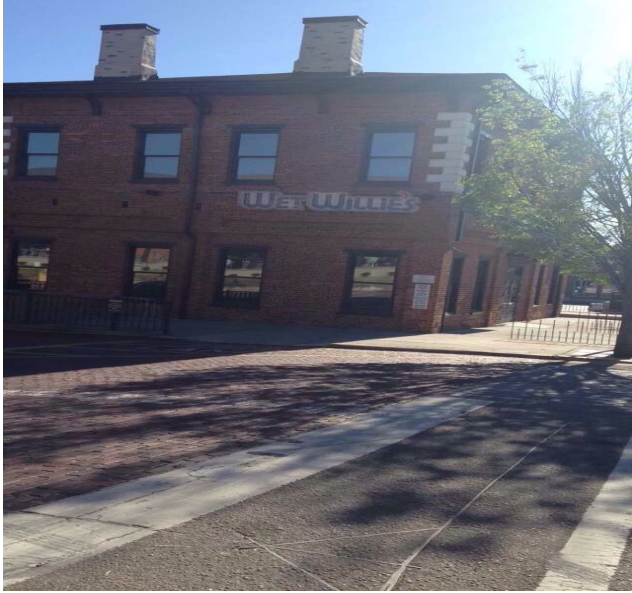
One of the many buildings and restaurants located around the city of Columbia.